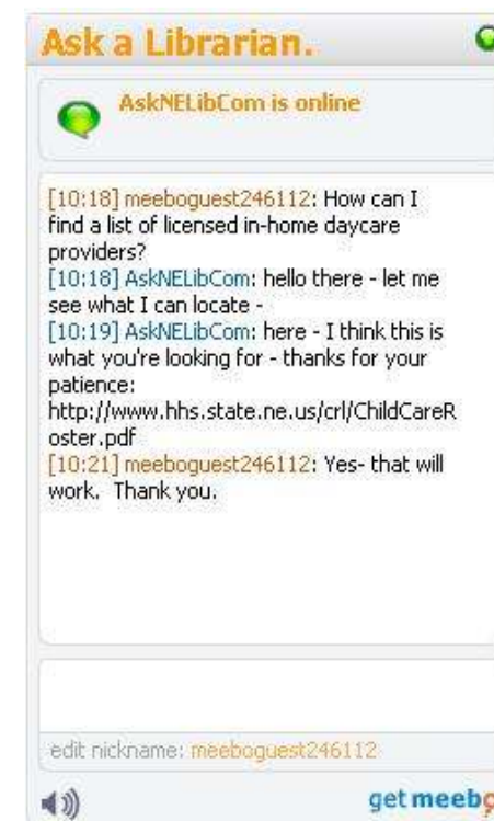
Ask a Librarian - Government Information Services http://www.nlc.state.ne.us/docs/needhelp.html

One of the benefits of a chat based contact center is that the customer support representative can handle more than one chat at a time. They can multiplex. Hence they are able to provide support to more customers in lesser time.